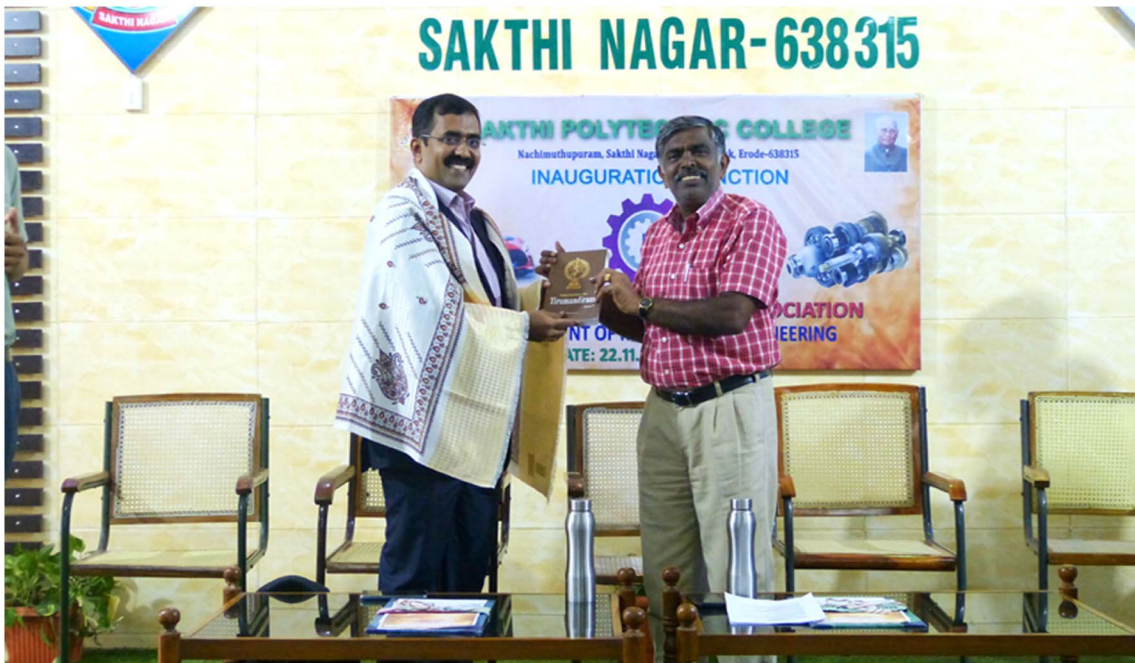
PRESENTING THE MEMENTO