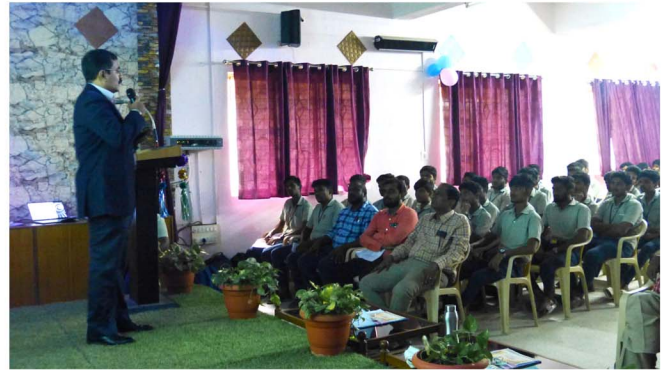
SPECIAL ADDRESS BY CHIEF Guset