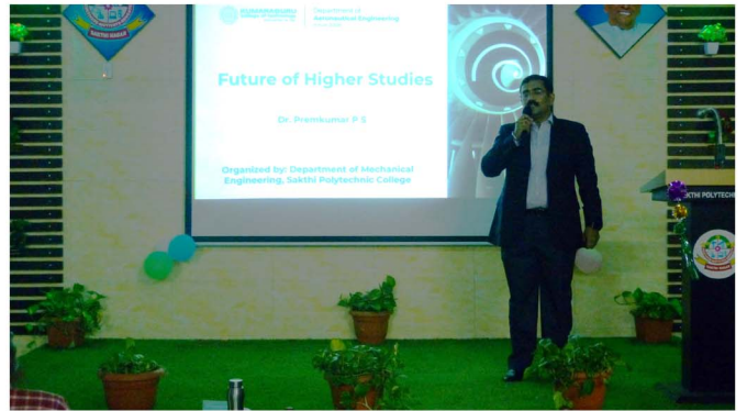
PRESENTATION ABOUT "FUTURE OF HIGHER STUDIES"