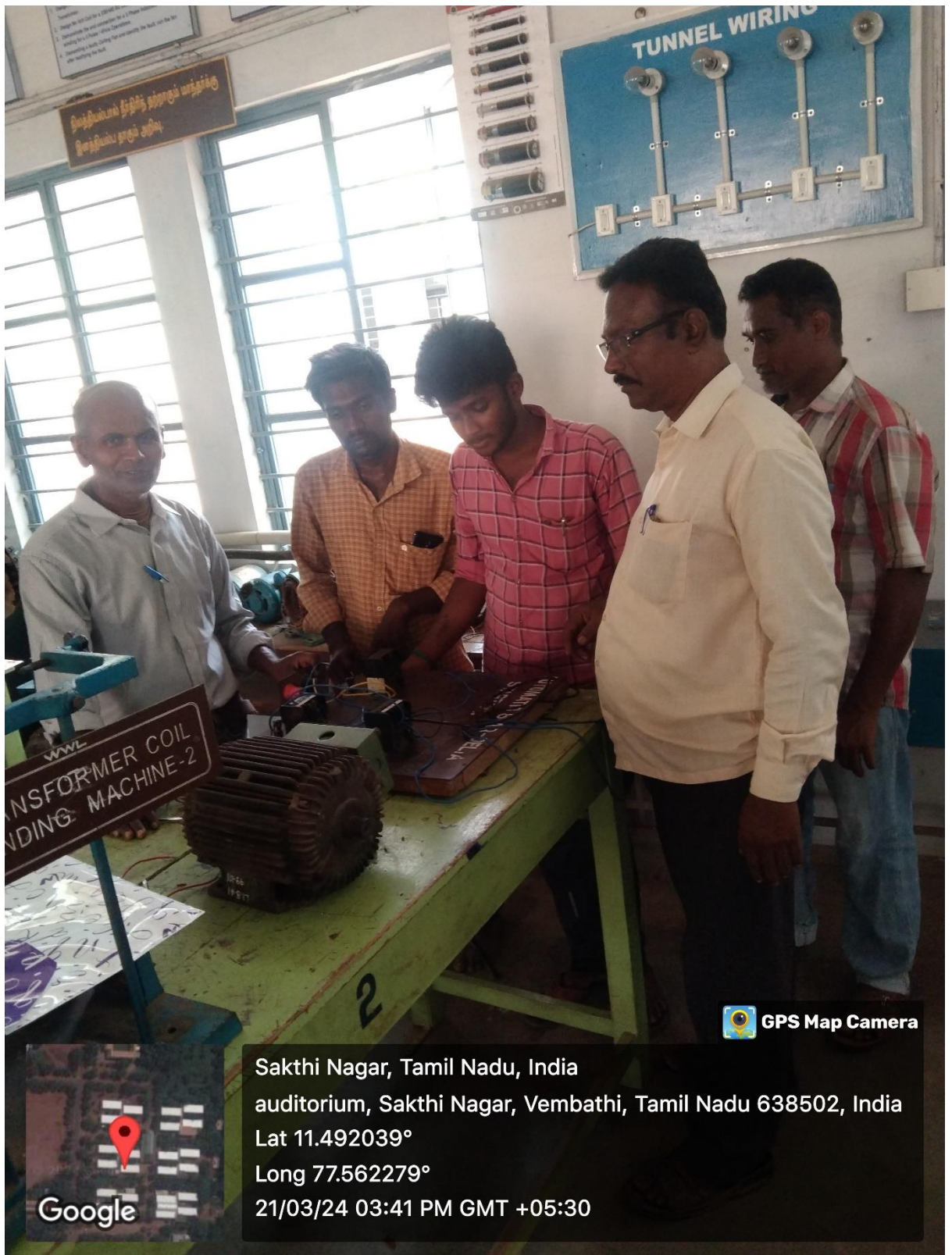
Three Phase Induction Motor Wiring Practical