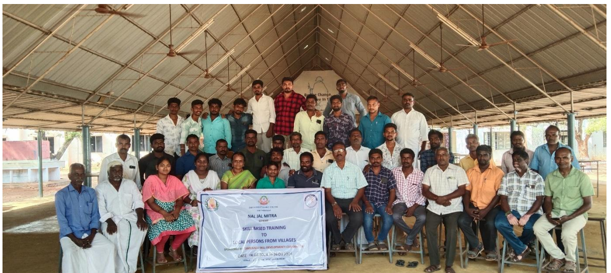
NAL JAL MITRA Group Photo on 26.3.2024