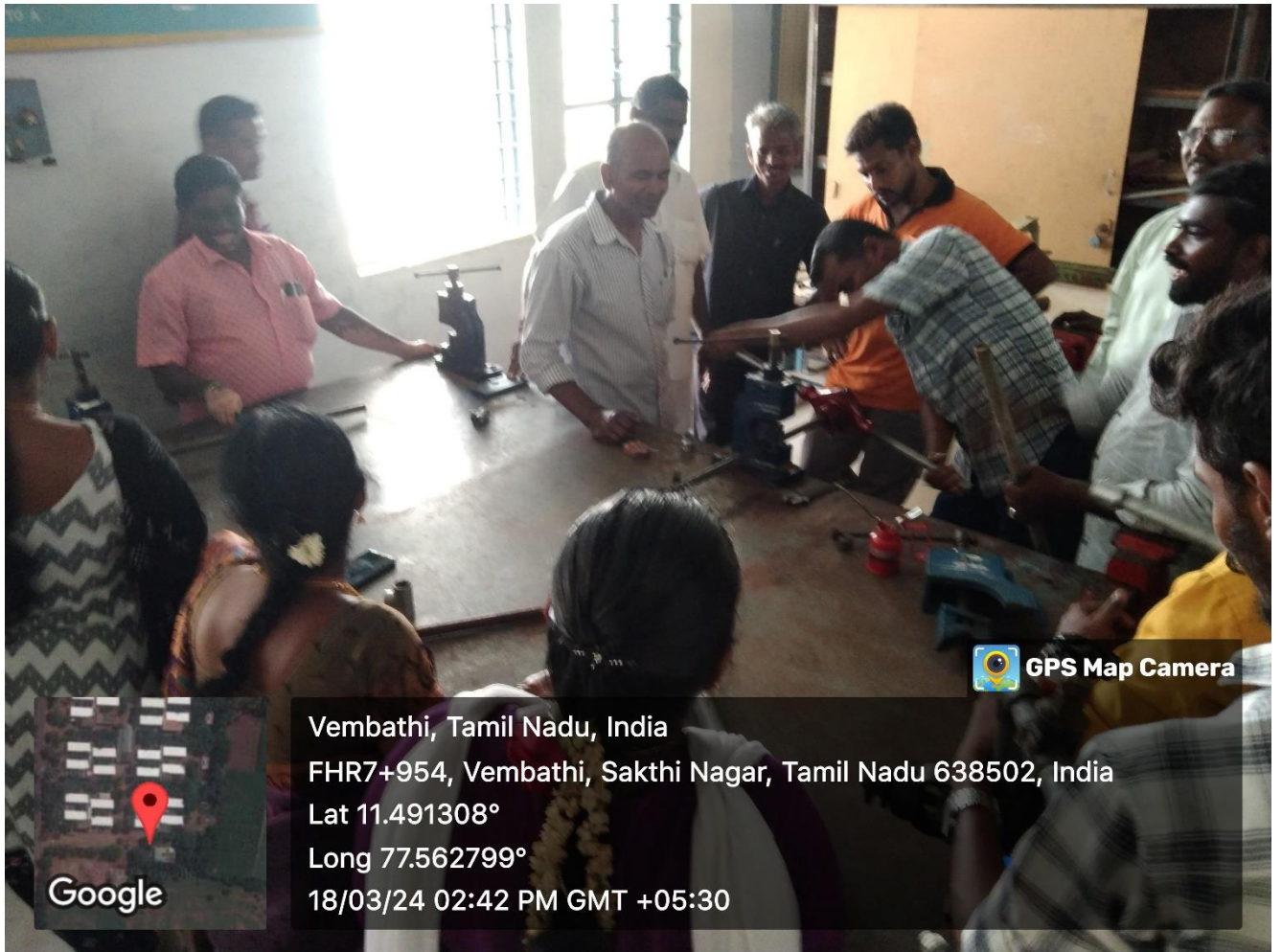
Making GI pipe threading