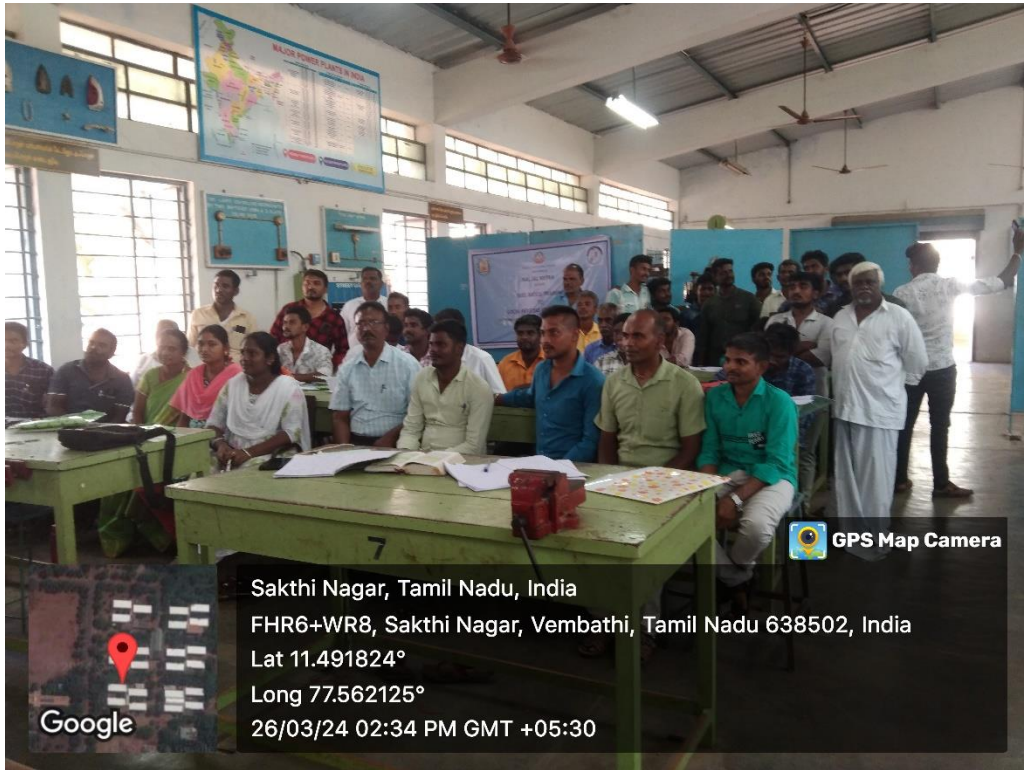
One of the Theory Class