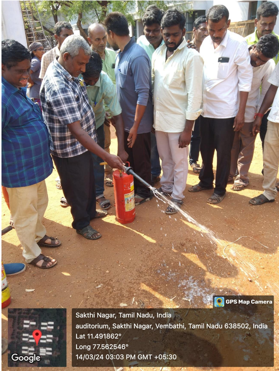
CO2 fire extinguisher Demo