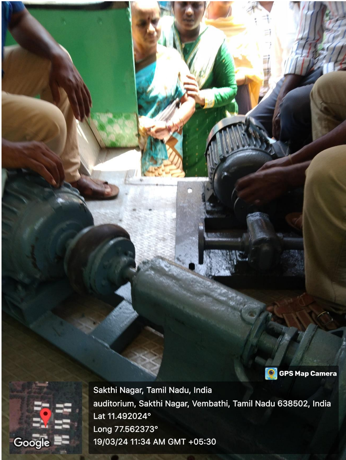
Practical exposure on the 10 hp pump