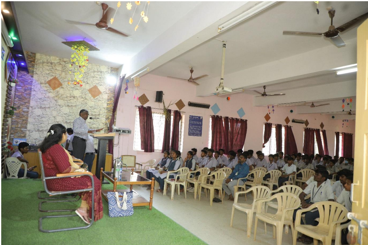
Principal Presided the function