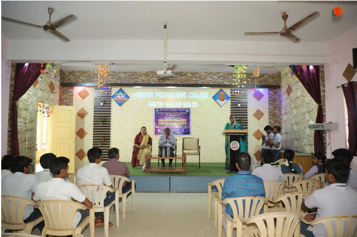
Mentor Introduce the Club (SC ID: 7827) to the participants