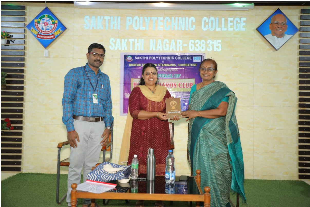
MEMENTO TO THE CHIEF GUEST