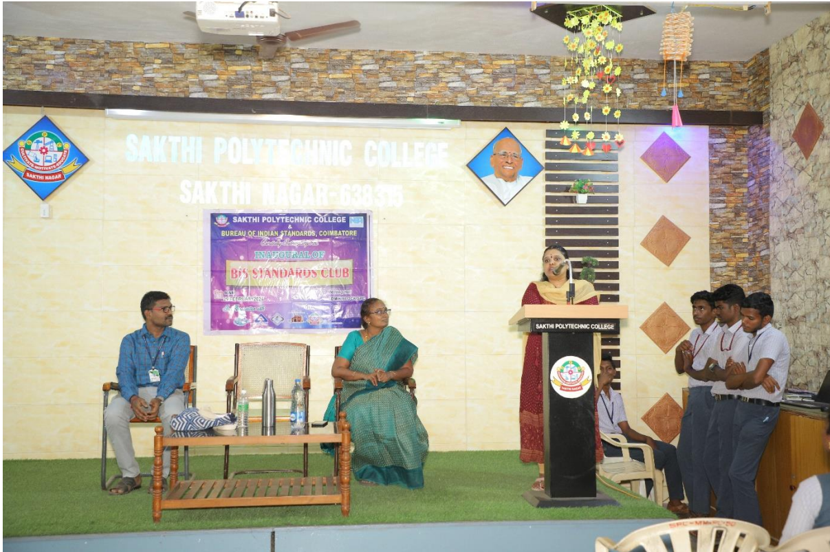
Chief guest inaugurated the Club