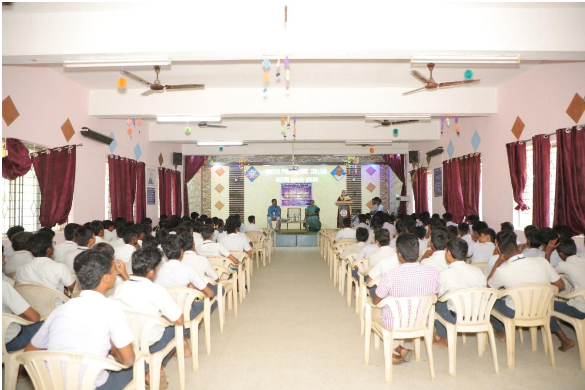
Club members understood the Importance of BIS